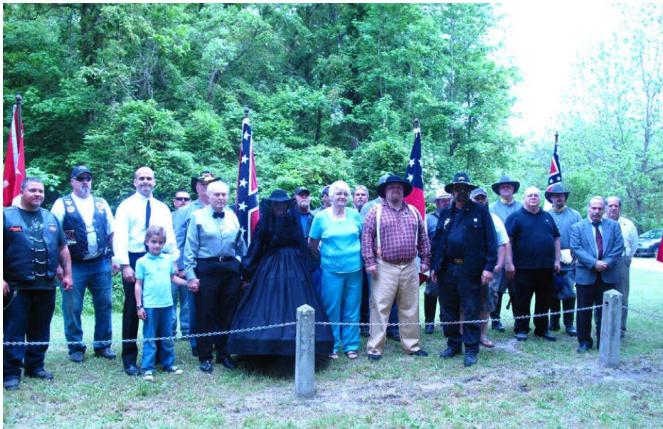
Gathering of all those who contributed to our first Confederate Memorial Day service.