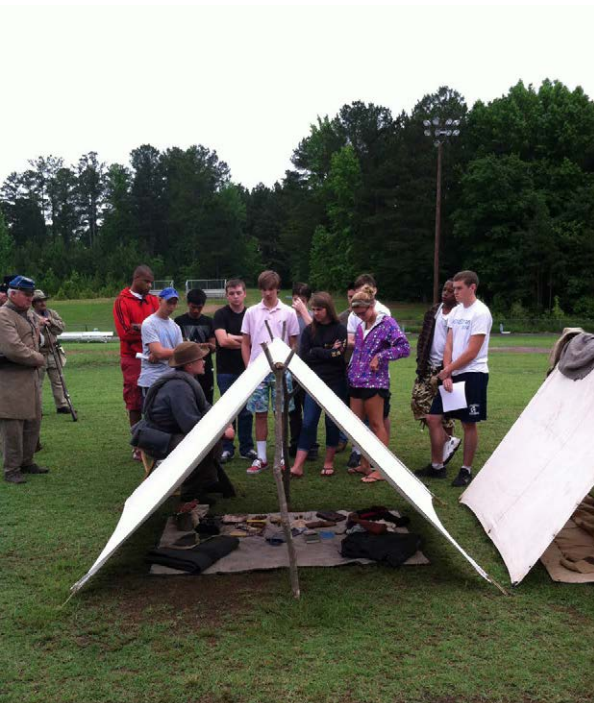
Students taught about how soldiers would spend their time in camp.