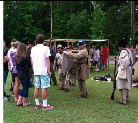
Members of the 6 th NC speaking about our ancestors' uniforms.