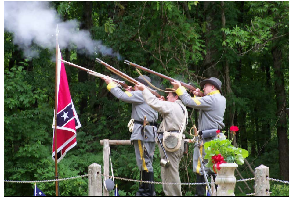
Camp 2205 Honor Guard.