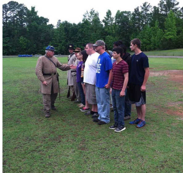
JROTC students participating in drill.